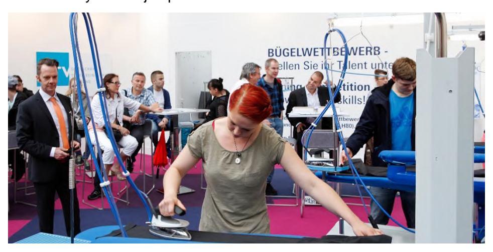
The trade fair experience at Texcare International

From 20 to 23 June, for the first time at the heart of the fair's activities in Hall 8.0, the Texcare Forum will shed light on topics of current interest in the sector. The open conference will be divided into two professional strands, aimed at dry cleaners and smaller laundries in the morning and larger operations and textile services in the afternoon. In panel discussions and brief presentations, experts will address the challenges in the textile care sector – from digitisation to automation, and sustainability to new job profiles.